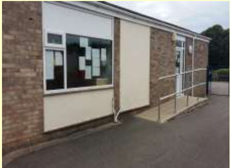
Before and After School Entrance